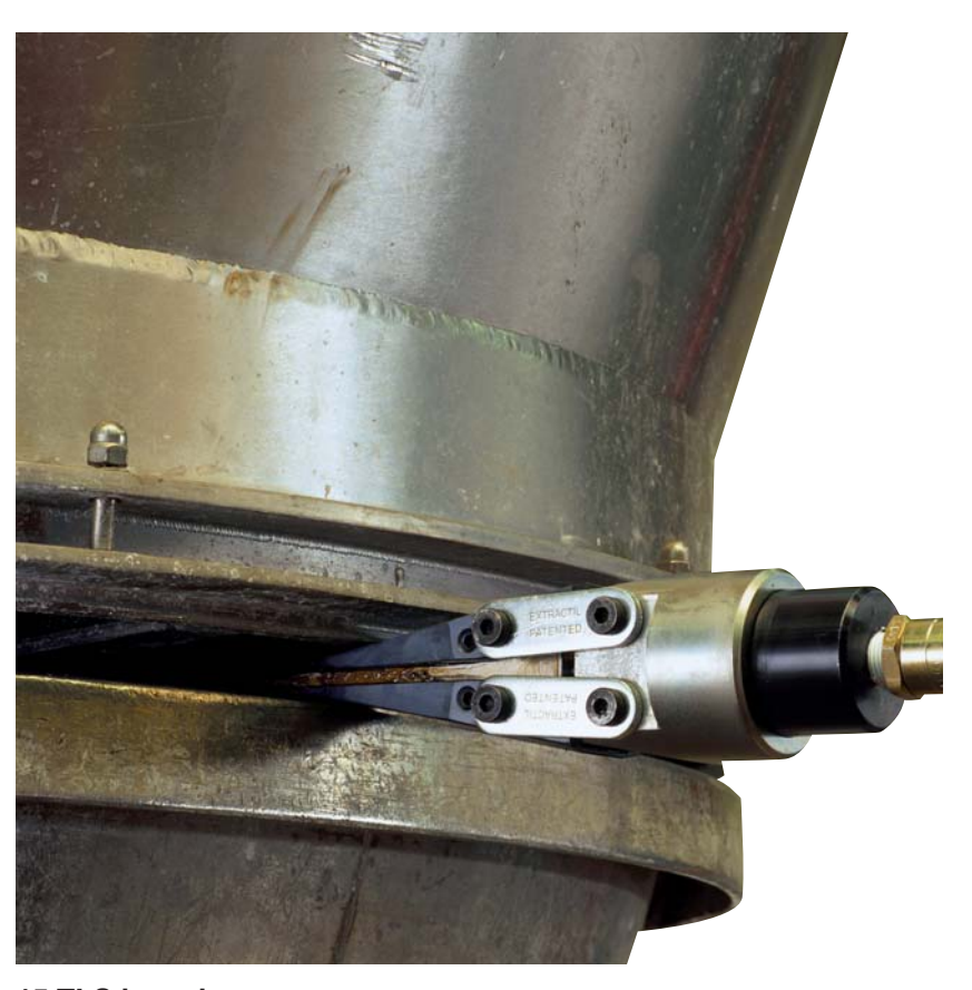
15 TLS in action